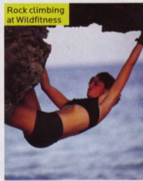
Rock climbing at Wildfitness

location. Skilled personal trainers address every aspect of fitness, from posture assessments and agility lessons to exercise "adhesion" once you're back to reality. Spiritual and nutritional workshops are included. From $5,300 for nine days (includes meals, assessments, two to three training sessions daily, two massages, and more), wildfitness.com.