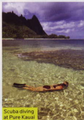
Scuba diving at Pure Kauai